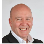
Willie Coffey Scottish National Party