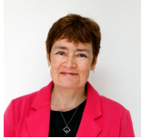
Sarah Boyack Scottish Labour