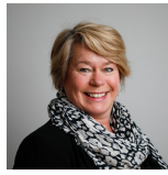
Deputy Convener Michelle Thomson Scottish National Party