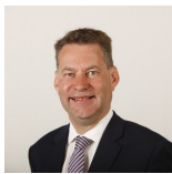
Murdo Fraser Scottish Conservative and Unionist Party