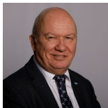
Gordon MacDonald Scottish National Party