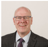
Kevin Stewart Scottish National Party