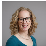
Lorna Slater Scottish Green Party