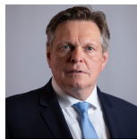
Stephen Kerr Scottish Conservative and Unionist Party